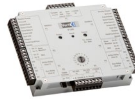
◀ VertX V100 Dual-Reader Module

Choose the Synergis IP access control solution to protect your people and assets with your choice of widely-deployed, non-proprietary, and secure access control hardware.