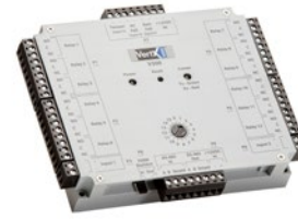
◀ VertX V300 Output Module

Choose the Synergis IP access control solution to protect your people and assets with your choice of widely-deployed, non-proprietary, and secure access control hardware.