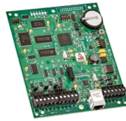
◀ Mercury Security EP2500 Intelligent Controller

Choose the Synergis IP access control solution to protect your people and assets with your choice of widely-deployed, non-proprietary, and secure access control hardware.